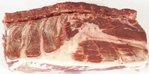
1 Collar of pork – bone-in.