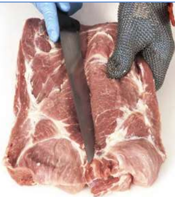
4 Butterfly cut the joint into two lengthways to create two equal pieces.