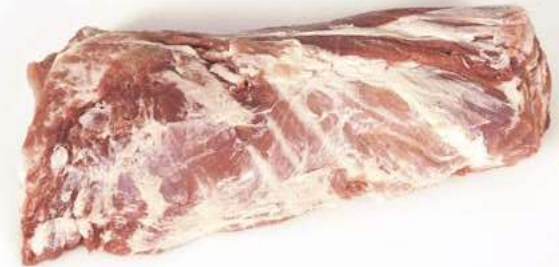
3 Remove the bones by sheet boning.