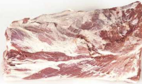
2 Collar of pork – bone-in.